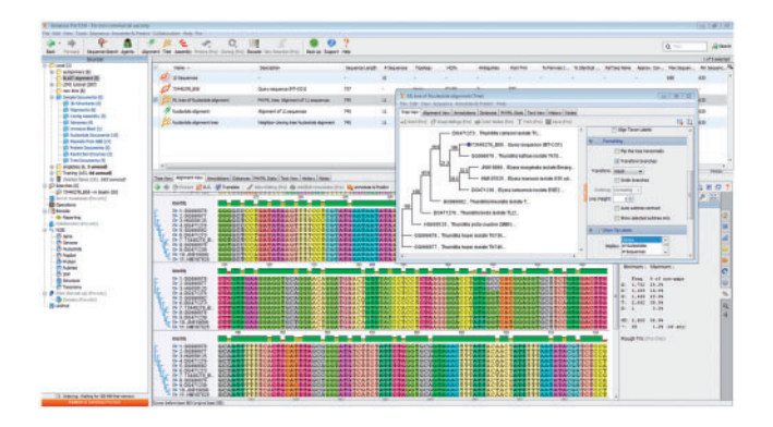
Fig. 2. The phylogenetic tree showing the relationship of a MT-CO1 sequence from an unknown source with similar public sequence. Sequences were identified from Genbank using BLAST. Sequences were downloaded then aligned using the Geneious Aligner and a phylogenetic tree built using PhyML. All of these steps were performed within Geneious Basic.

functions for common bioinformatics analyses. Geneious Basic displays selected file(s) in a variety of different ways including sequence view (linear and circular), dotplot view, query-centric alignment view, protein domain view, 3D structure view, text view and notes.