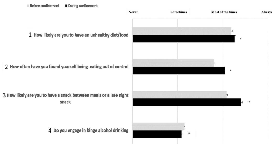
Figure 1. Participants’ scores in response to the related diet behaviour questions. *: Significant differences between “before” and “during” COVID-19 home confinement period.

Recorded scores in responses to the diet behaviour questionnaire before and during home confinement are presented in Figure 1 (question 1 to 4) and 2 (question 5). For detailed distribution of responses (in %), please see Table S1 (Supplementary File).