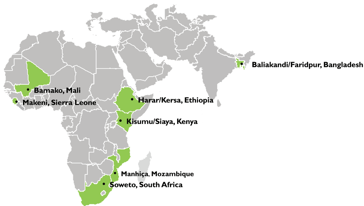
Figure 3. Map of Child Health and Mortality Prevention Surveillance sites. Abbreviation: CHAMPS, Child Health and Mortality Prevention Surveillance.

To monitor demographic trends and calculate mortality rates, most sites conduct surveillance within a health and demographic surveillance system (HDSS). An HDSS