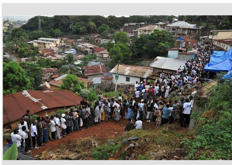
Figure 2 Ebola virus blood testing by government health workers in the Kenema district, Sierra Leone, June 25, 2014.

Unfortunately, several countries in Africa, as well as governmental and research institutions, are inadequately equipped in diagnostics, tracking, active reporting, prompt healthcare delivery, and accessible and affordable treatment to combat the Ebola infection and other emerging infectious diseases. The development of new tools, strategies and approaches, such as improved diagnostics and novel therapies including vaccines, is needed to prevent, control and contain Ebola as well as SARS, bird flu, Lassa fever, dengue and MERS outbreaks. Hence, the urgent need to develop and implement early warning alert and active surveillance response systems for emerging infectious diseases and the control and elimination of NTDs, as well as early warning and emergency systems, cannot be overemphasised. The prerequisites for fighting and