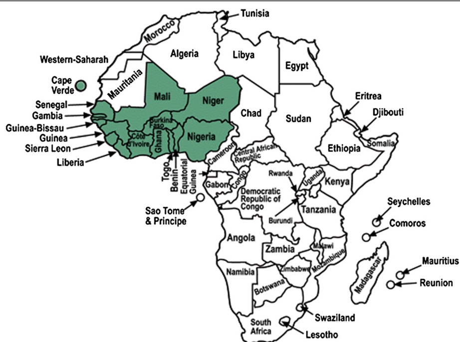
Figure 1 Western Africa: Economic Community of Western African States (ECOWAS) Countries: Benin, Burkina Faso, Cape Verde, Cote d'Ivoire, Gambia, Ghana, Guinea, Guinea-Bissau, Liberia, Mali, Niger, Nigeria, Senegal, Sierra Leone and Togo.

First, the need to urgently recognise and coordinate outbreak action-responses in affected African countries and in cross-border neighbours, as well as collaboration with those that experienced outbreaks in the past, is vital.