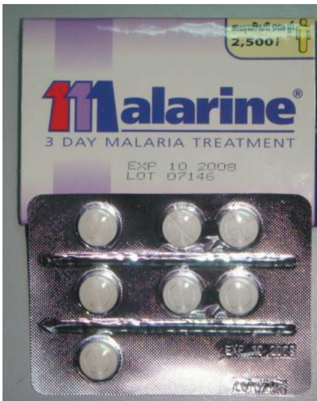
Figure 2 Malarine for Adult (2008).

programme being handed over to Population Services International (PSI) in February 2003.