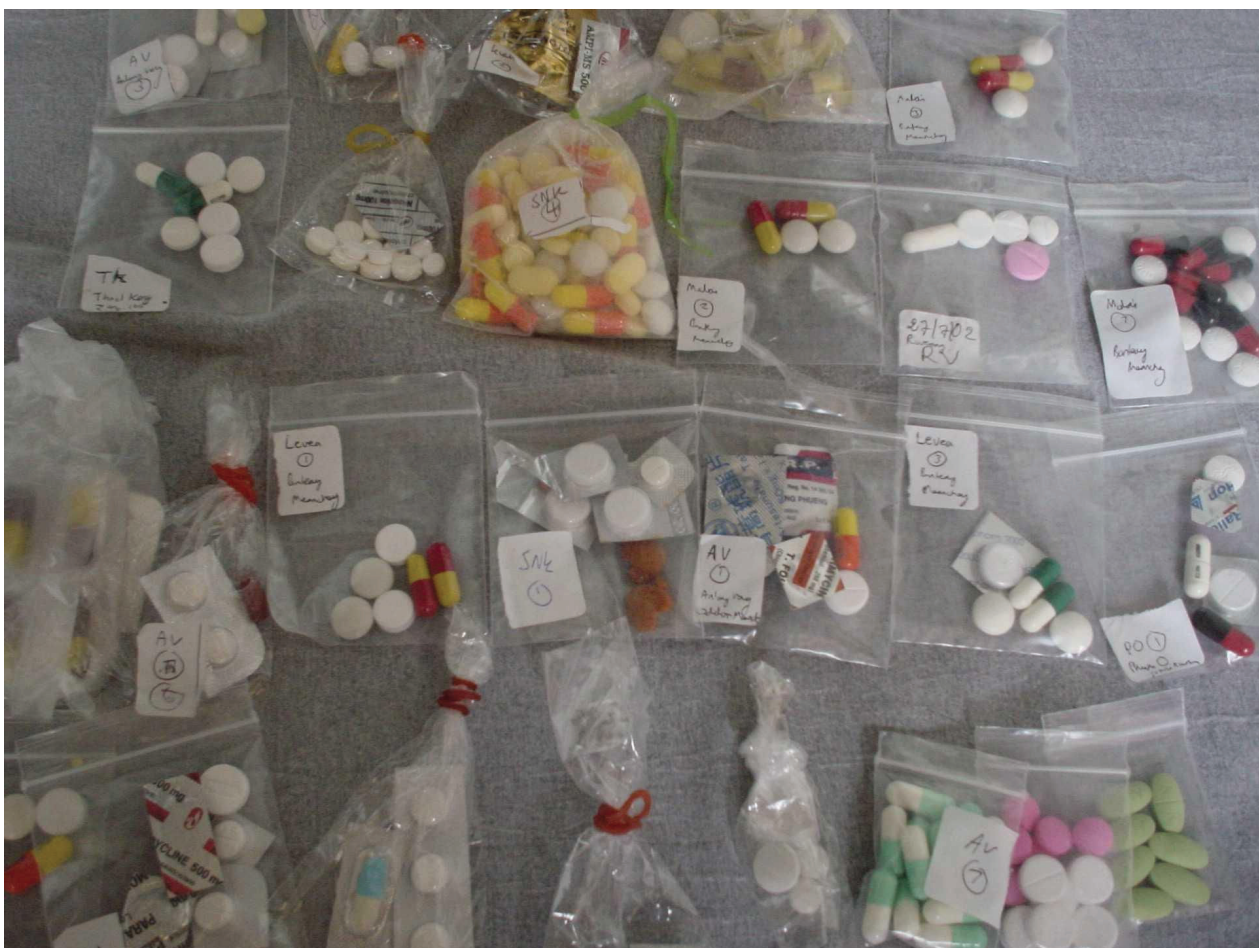
Figure 4 Drug "cocktails". An assortment of mixed drug "cocktails", which are a mix of several different types of drugs sold in little plastic bags, often used for treating fever in Cambodia [28].

nearly 88% of respondents knew that malaria symptoms could be associated with other diseases but around a third reported that malaria infection could be confirmed without a blood test [42].