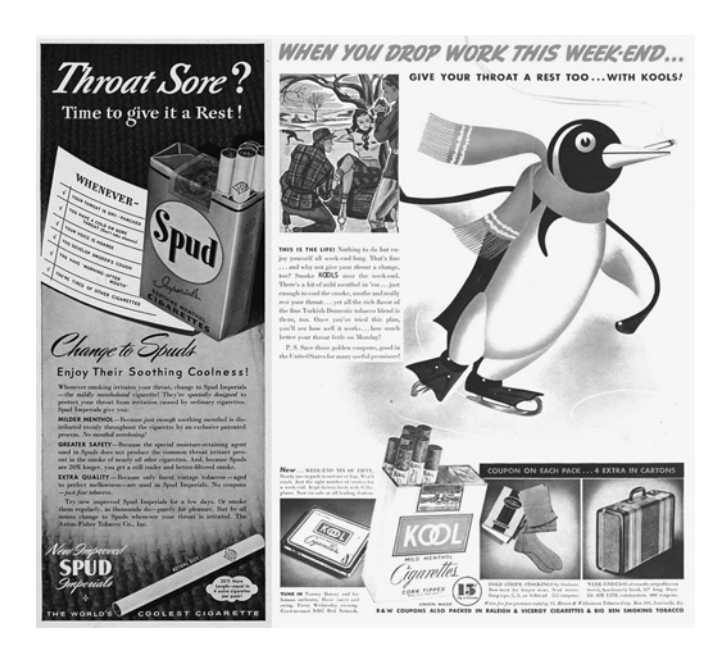
Figure 1 Spuds brand and Kool brand cigarettes, the earliest two brands to be marketed specifically as mentholated brands in the US, were presented in the 1920s and 1930s as brands that provide relief from the throat pain and irritation caused by smoking (images retrieved from http://lane.stanford.edu/tobacco/index.html).

Tobacco company executives sought to emphasise health messages in the marketing of menthol products relative to non-menthol products from the beginning. The advertising firm Cunningham & Walsh compiled a report for B&W in 1980 in which they observed that Kool's '(r)emedial specialty brand image' in the early 1950s 'benefits (the b)rand as smokers perceive menthol as less harmful'. <sup>32</sup> In a 1960s brand evaluation, B&W noted that '(e)mphasis on the throat, with its important