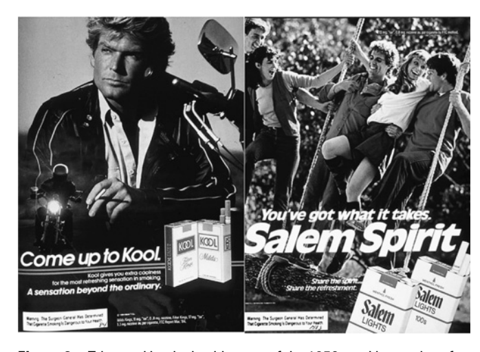
Figure 2 Triggered by the health scare of the 1950s and increasing after the 1964 US Surgeon General's Report, advertisements for menthol brands emphasised general refreshment and coolness rather than the explicit health messages of earlier decades. Menthol nevertheless continued to carry the medicinal and health connotations of previous decades (images from the 1980s, retrieved from http://www.tobacco.org/ads).

Kool apparently capitalized on this aspect of the 1960s by simply advertising to Blacks before its competitors did. Kool ads were in