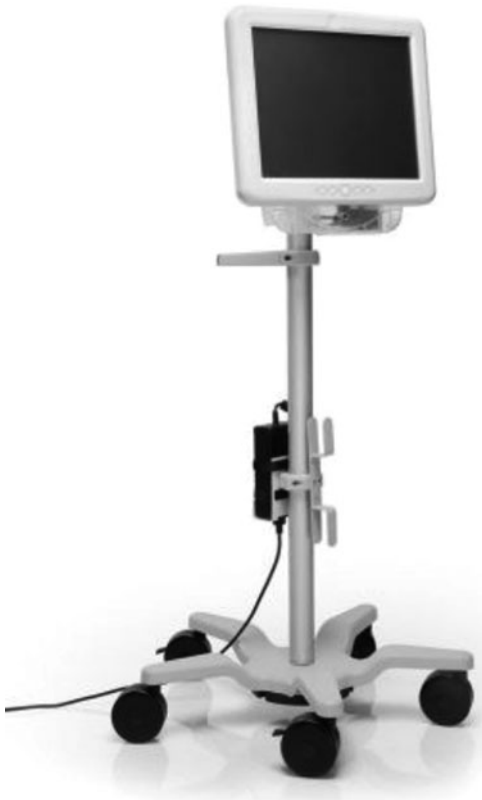
FIG. 2. LithoVue's monitor.

the level of sacroiliac joint. The reusable digital ureteroscope was unable to reach one calix of the lower pole (Renal unit 2) and one calix of the upper pole (Renal unit 3) without UAS placement, probably because of the large diameter of the ureteroscope and the reduced shaft rigidity. Lower pole access with baskets and laser fibers was possible for each ureteroscope after UAS placement (Table 2). No statistically significant differences were detected in angle deflection