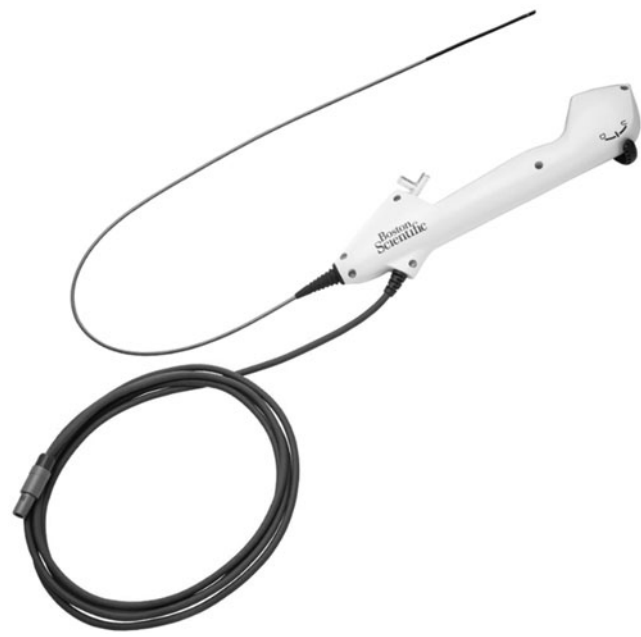
FIG. 1. LithoVue: single-use digital flexible ureteroscope.

Data are presented as mean and standard deviation. Between-groups comparisons were made using Kruskal–Wallis test. A p value <0.05 was considered significant. Statistical analyses were